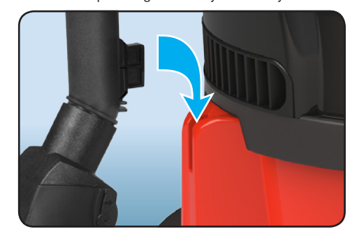
Wand docking system