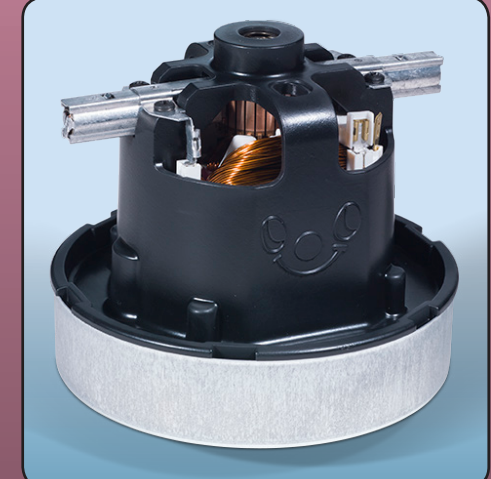
Numatic high efficiency longlife motor