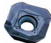
Art. Nr. 1955