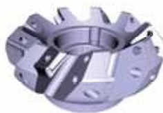
Art. Nr. 1943