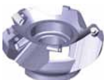
Art. Nr. 1946