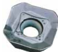
Art. Nr. 1945