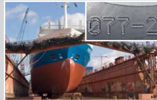
Ship building industry