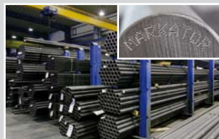
Stainless steel trade