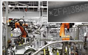
Car body construction