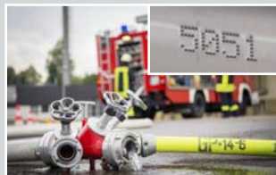
Equipment of fire brigades