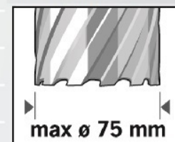
Core Drilling 12 - 75 mm