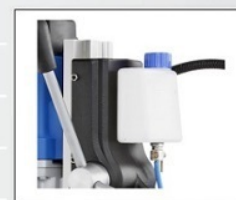
Attached lubrication tank