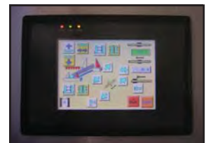
Optional N.C. Controller