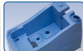
Polyform 40 litre clean water tank