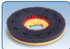
55cm Long life light duty scrubbing brush