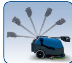
Easy storage fold down handle