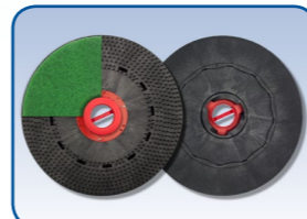
36/40/50cm PadLoc pad drive system