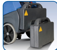
Quick change gel battery pack