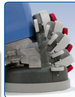
DeckLoc tilt mechanism