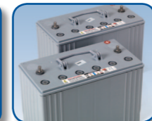
2x Fully sealed gel batteries