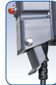
Simple plug-in and charge