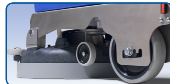
Full stainless steel chassis