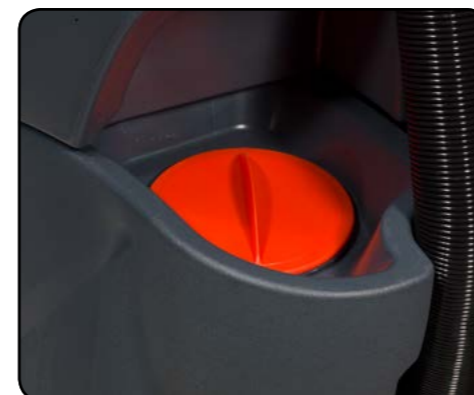
Additional fill and filter point