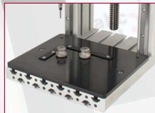
Type-plate with fix stop limit bars (optional)