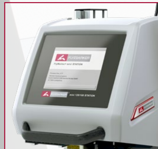
Available without touchscreen Input via USB keyboard