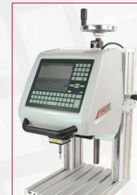
Column frame with handwheel (optional)