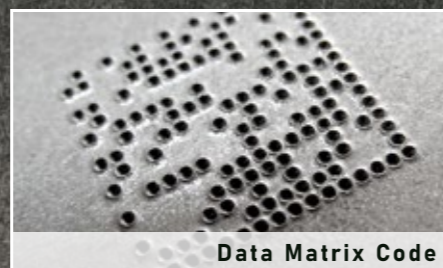
Data Matrix Code