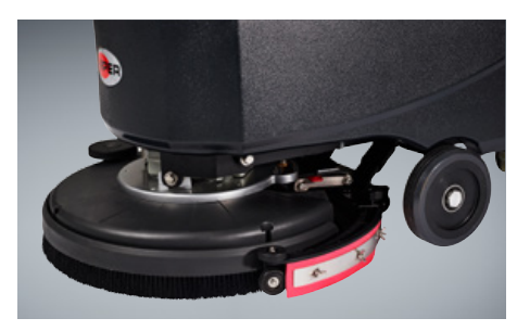
Tool-free removal and assembly of squeegee simplifies maintenance