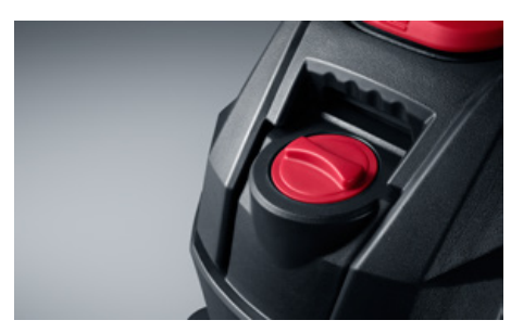
Convenient front access to solution tank for guick refills