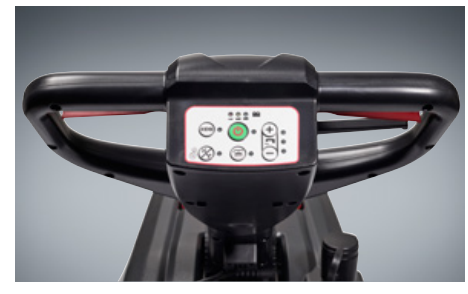
Intuitive control panel provides control over all functions (AS4325 model)